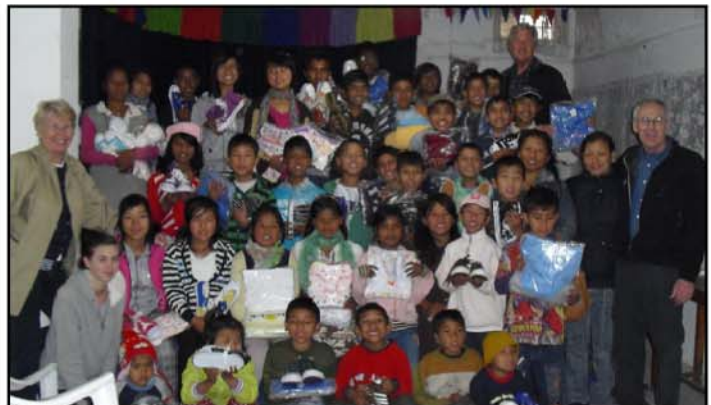
(Right) After a big party with the Ashish Home kids, team members and children posed together for a photo.

Would we go again? It is probably too soon to make that decision but as ambassadors for Jesus, Romans 10:14 says "How, then, can they call on the one they have not believed in? And how can they believe in the one of whom they have not heard? And how can they hear without someone telling them?"