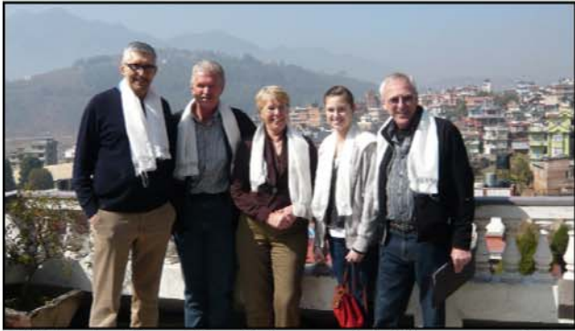
Kidstown's "Team Nepal" journeyed half-way around the world to extend help, hope, and the Gospel to orphan kids.