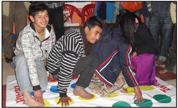
Teen-agers at the Praise Home got a kick out of Twister.