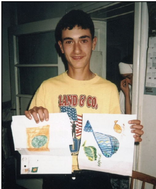
Receiving small tokens, such as drawings, mean a great deal to a child who has been abandoned.

Children in Romanian and Indian orphanages live with varying levels of emotional damage due to their backgrounds of neglect, poverty, and abandonment. These children are starving for love and attention and deeply desire to be accepted and befriended by others. When they receive love and acceptance, the deep emotional wounds begin to heal. Their inner sense of worthlessness is challenged when someone befriends them. Like a crab emerging from its shell, these children emerge from their protective defenses when a person pays them attention. We, as sponsors of