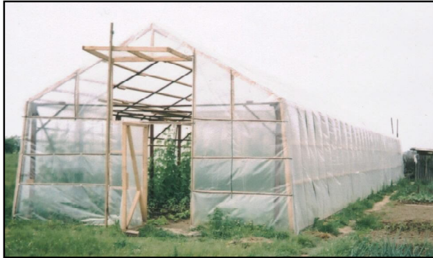
High-grade greenhouse plastic, donated by Pacific Growers in Lynden, Washington, has allowed the orphanage to have a greenhouse.

The Casa Otniel is a small orphanage which provides shelter and housing to 21 abandoned children. Built in the 1990's by two Dutch aid organizations, the Casa Otniel is now completely operated by Romanians. Children which have lived or currently live in this orphanage all have very traumatic histories. Some have lived in government orphanages, some have come from very volatile family situations, others from conditions of extreme poverty. At the Casa Otniel they find