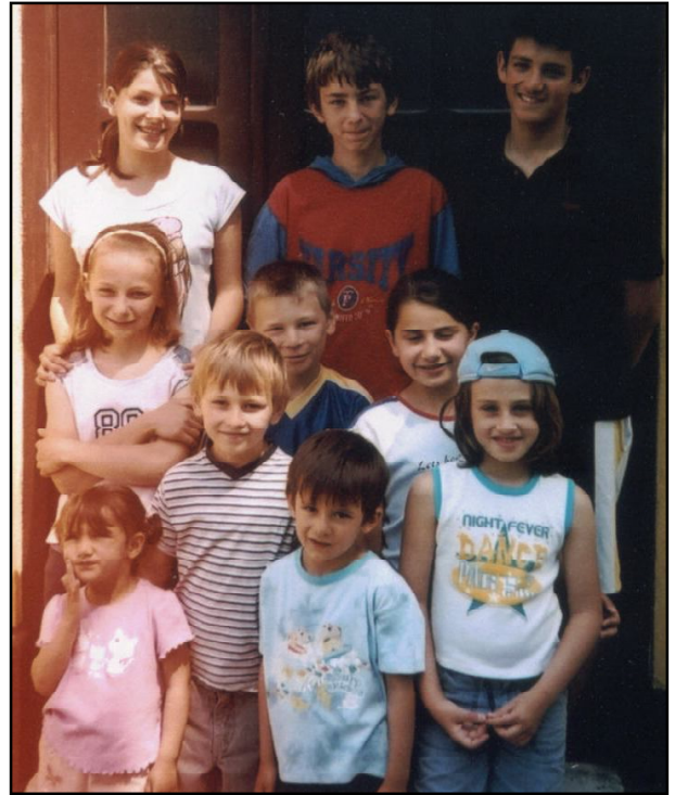
These 10 children, all orphans, now have a home.