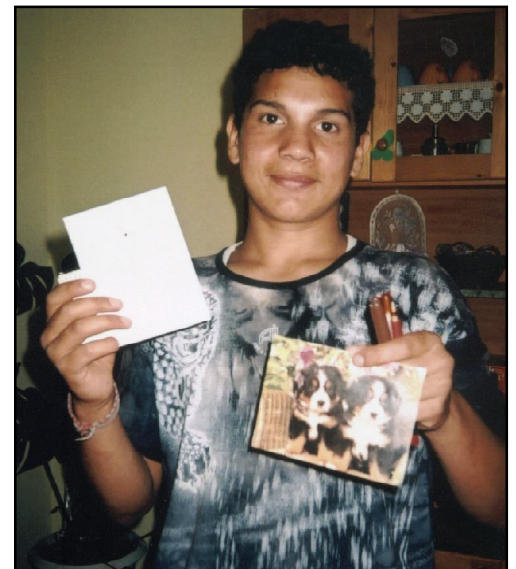
"What nice words!" was the response of this young man after receiving a letter from his sponsor.

May these comments help us to strive to be more faithful in communicating our love, acceptance, and friendship to our orphan children.